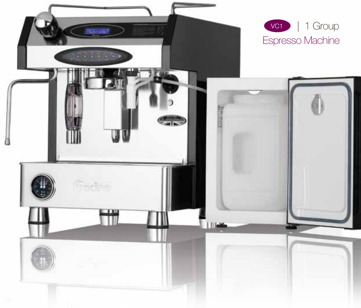
VC1 | 1 Group Espresso Machine

Introducing, the Velocino by Fracino, the state of the art hybrid espresso machine which pairs the convenience of a bean to cup machine, with the simplicity of a traditional espresso machine. Manufactured from the highest quality stainless steel, brass and copper components, it is a reliable and simple to maintain espresso machine, built to last a life time. This no nonsense new innovation has been specifically designed for sites with a high staff turnover, ensuring consistent, premium quality drinks each time, no matter how inexperienced the operator is. Combining the traditional E61 style chrome plated brass group with an automatic milk frother, advanced programming and an easy to understand control panel, the Velocino allows you to dispense all espresso based drinks straight into the cup at the press of a button.