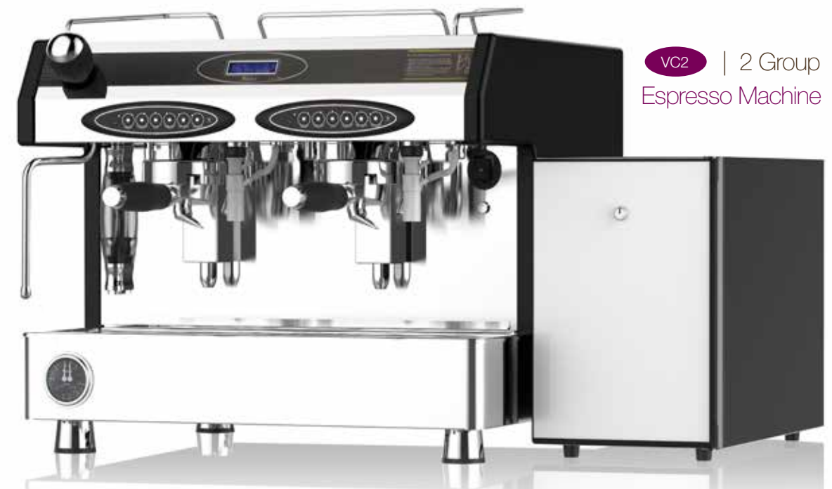
VC2 | 2 Group Espresso Machine