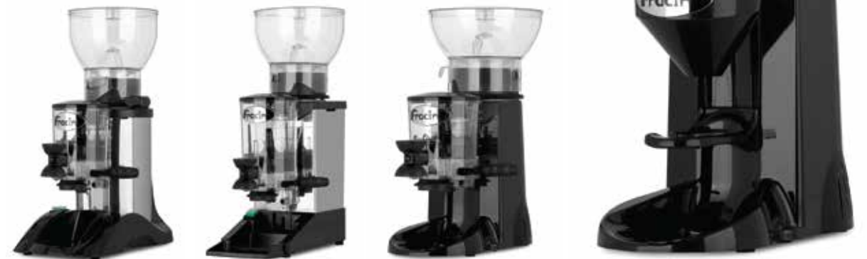
● Model B ● Model T ● Tranquilo Black ● Tranquilo single shot in Black

The models T and B grinders have polished stainless steel cases and are ideally suited to the Fracino range of espresso coffee machines. The models T, B and Tranquilo grinders are operated manually by an on/off switch. All grinders have adjustable grinding blades and coffee portion control. Coffee is dispensed into the filter holders by means of a flick lever mechanism. The Tranquilo grinder is also available in a chrome option and as a single shot grinder for the freshest coffee. (A tamper would be required for this option.)