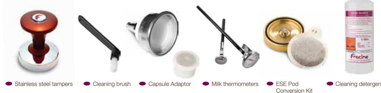
● Stainless steel tampers ● Cleaning brush ● Capsule Adaptor ● Milk thermometers ● ESE Pod Conversion Kit ● Cleaning detergent